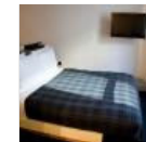
Where to put up visiting friends