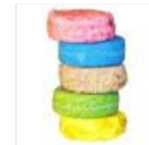
What to pack on the road